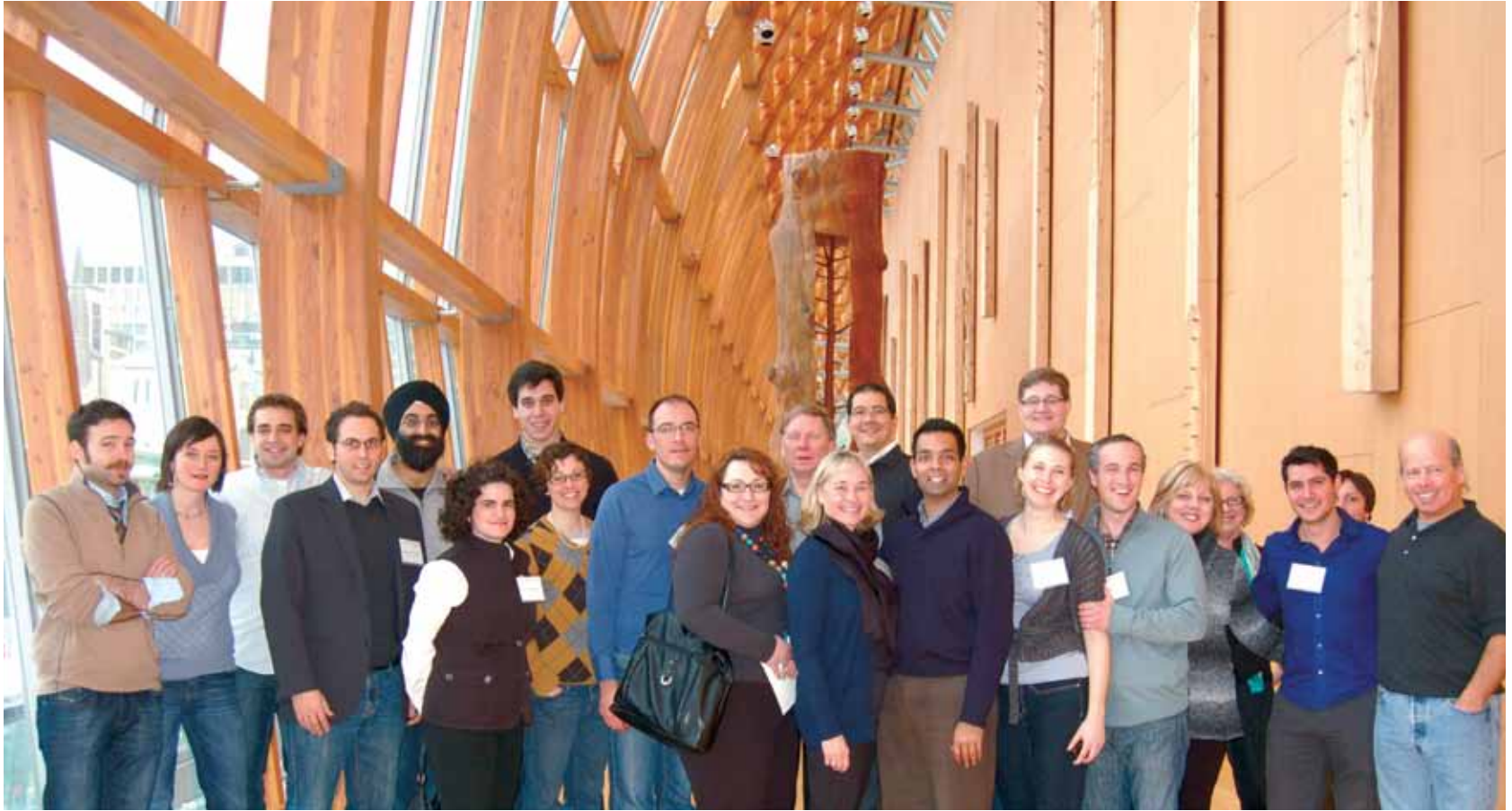
Visit to the Art Gallery of Ontario during the Toronto Conference

Our trip to Yellowknife gave me deep insights into the challenges and opportunities faced by Canadians in the North and particularly those from First Nations communities.