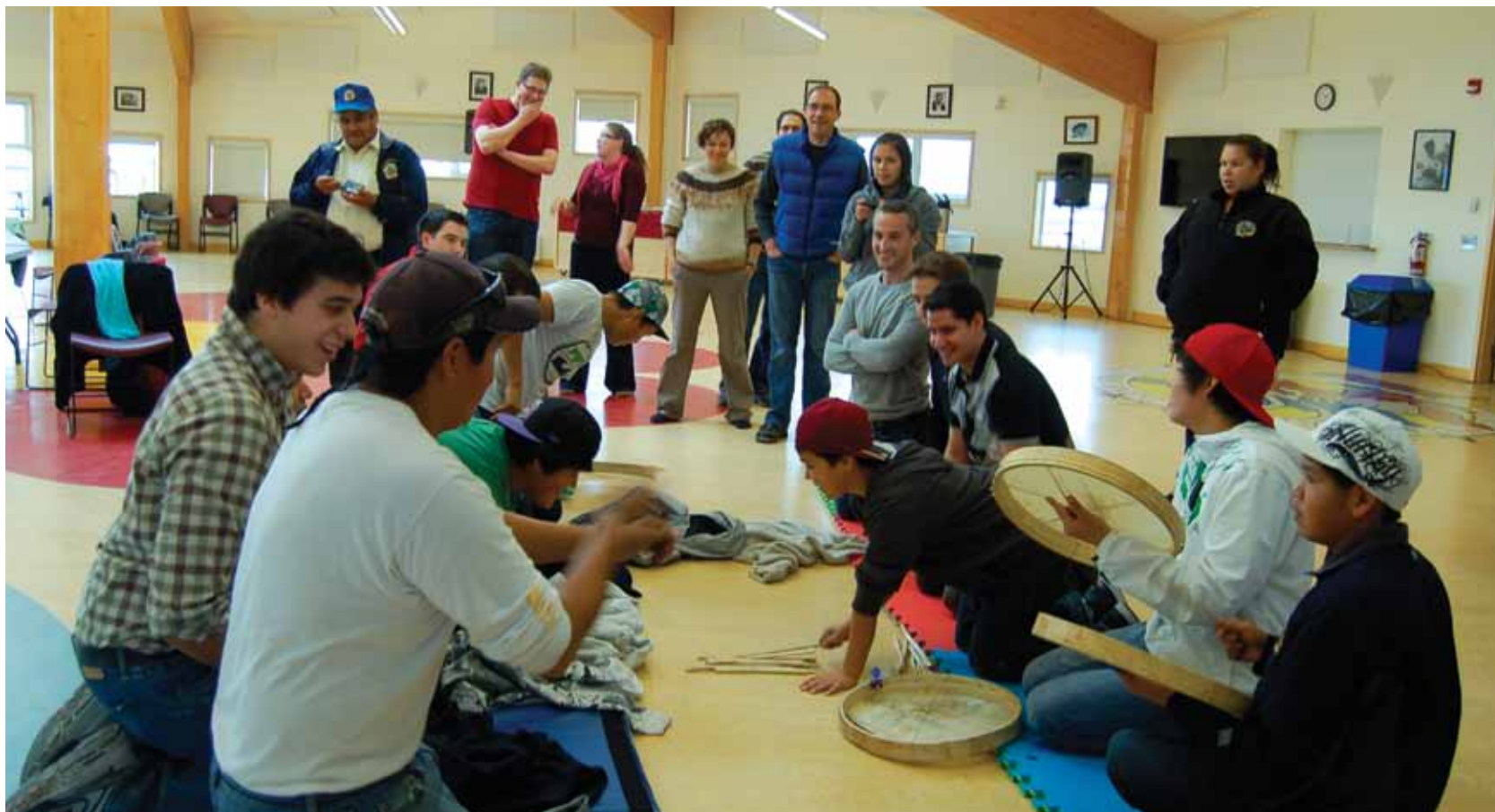
Fellows learn a traditional Dene hand game during visit to Dettah community, Northwest Territories

The 2010 working conferences took place in: Vancouver, Montreal, Yellowknife, St. John’s, Toronto, and Ottawa.