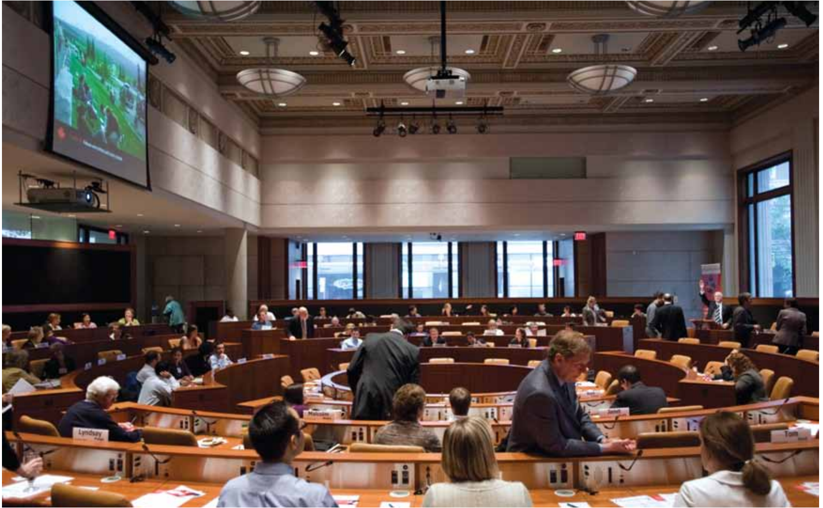
Public dialogue at the Morris J Wosk Centre for Dialogue, Simon Fraser University, Vancouver