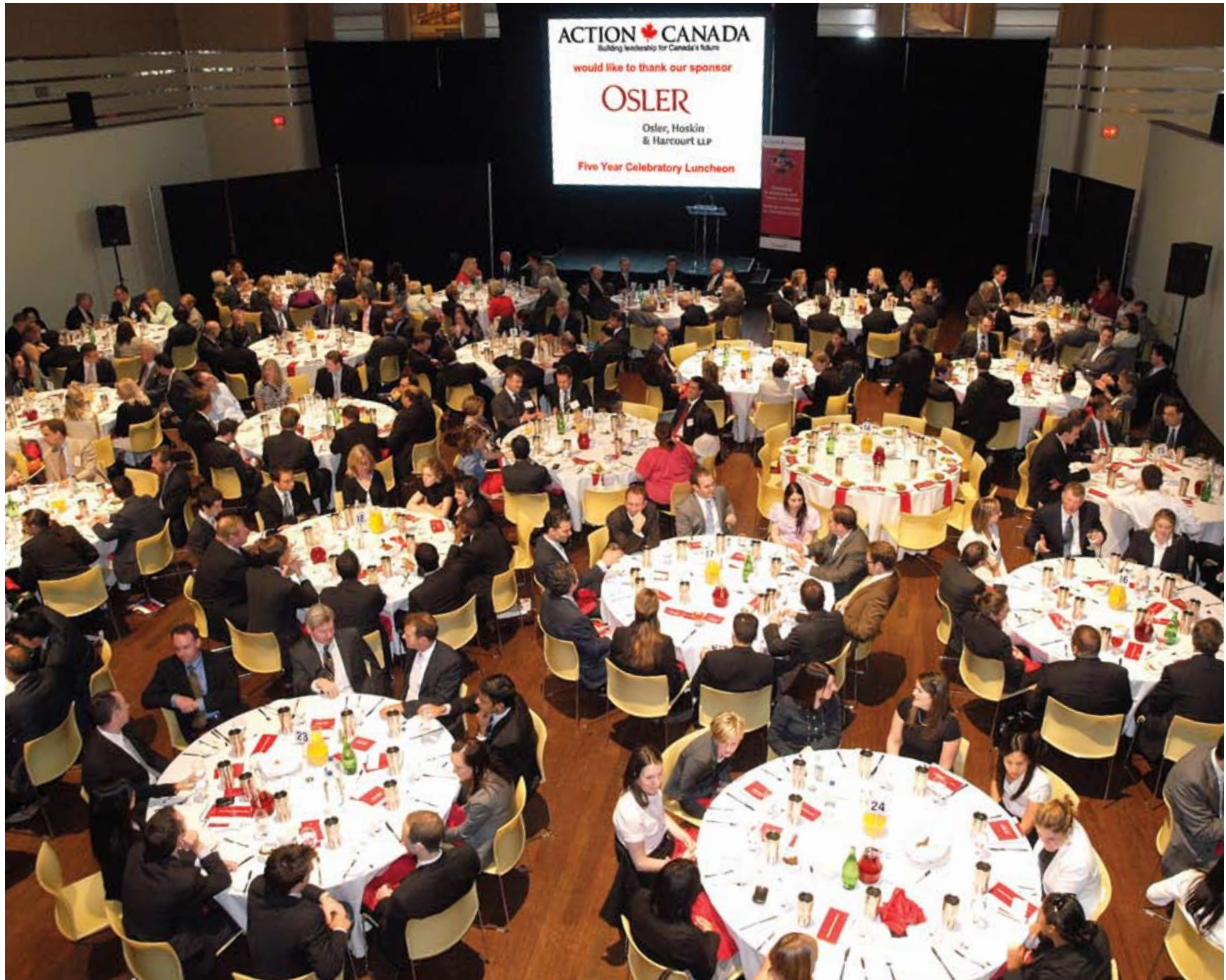
Fellows from all five fellowship years and guests from business, government and NGO sectors gathered at Toronto's Design Exchange to celebrate Action Canada's success.